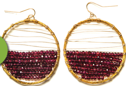
Garnet earrings from "The Florence Collection"