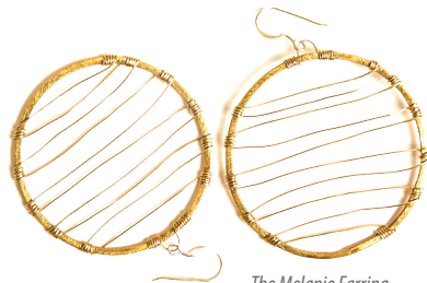
The Melanie Earring

18k Rose gold diamond pendant. 29- diamonds weighting 0.14ct $585.00