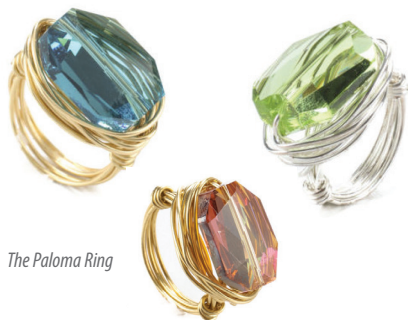
The Paloma Ring